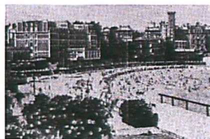
HOTEL DE LA VALLEE

Dinard, the most popular resort on the Breton Coast, has so much to offer that it cannot fail to please. It is warm throughout the whole of the season and its three beaches of firm golden sand ensure magnificent bathing.