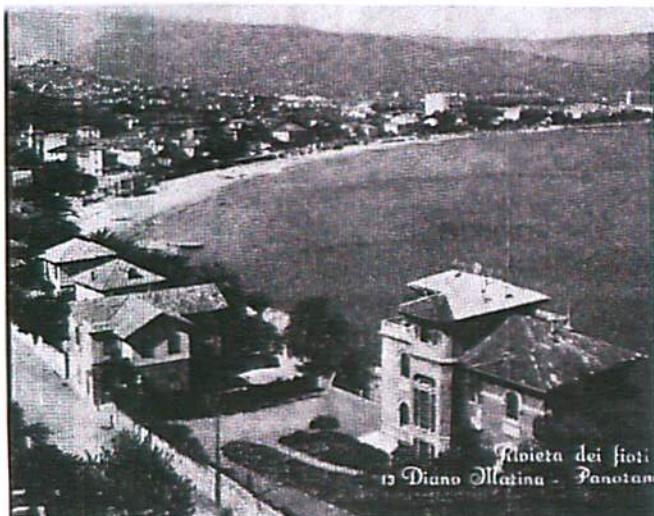
Riviera dei fiori 13 Diano Marina - Panotam