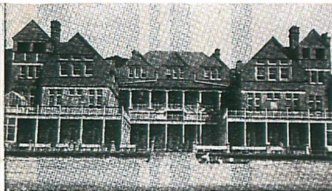
OUR OWN PRIVATE PROMENADE AT BEACH COURT