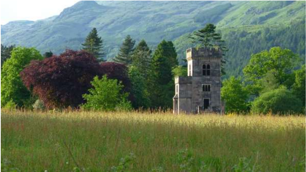
Glenfinart House today

The estate contained a very large garden that is situated between the Tower and nearby Loch Long. It was very well maintained and contained not only fruit and vegetables, known as the kitchen garden, but a large rose garden. A full time resident gardener and staff maintained it in magnificent condition and we have photographs and a painting supplied by a descendent to evidence this.