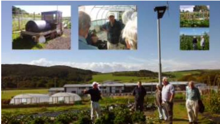
Fact-finding visit to Bute Produce