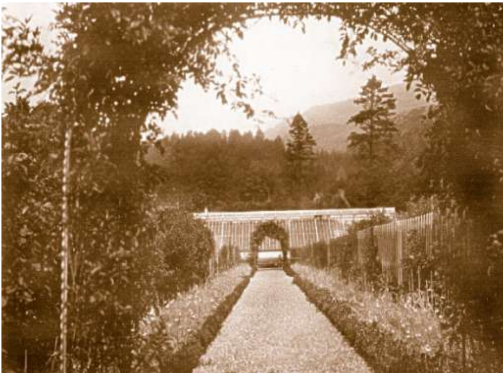
The Garden c.1900

The estate contained a very large garden that is situated between the Tower and nearby Loch Long. It was very well maintained and contained not only fruit and vegetables, known as the kitchen garden, but a large rose garden. A full time resident gardener and staff maintained it in magnificent condition and we have photographs and a painting supplied by a descendent to evidence this.