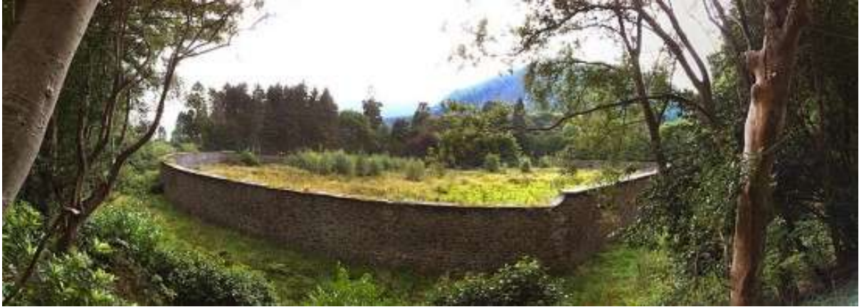
Glenfinart Walled Garden