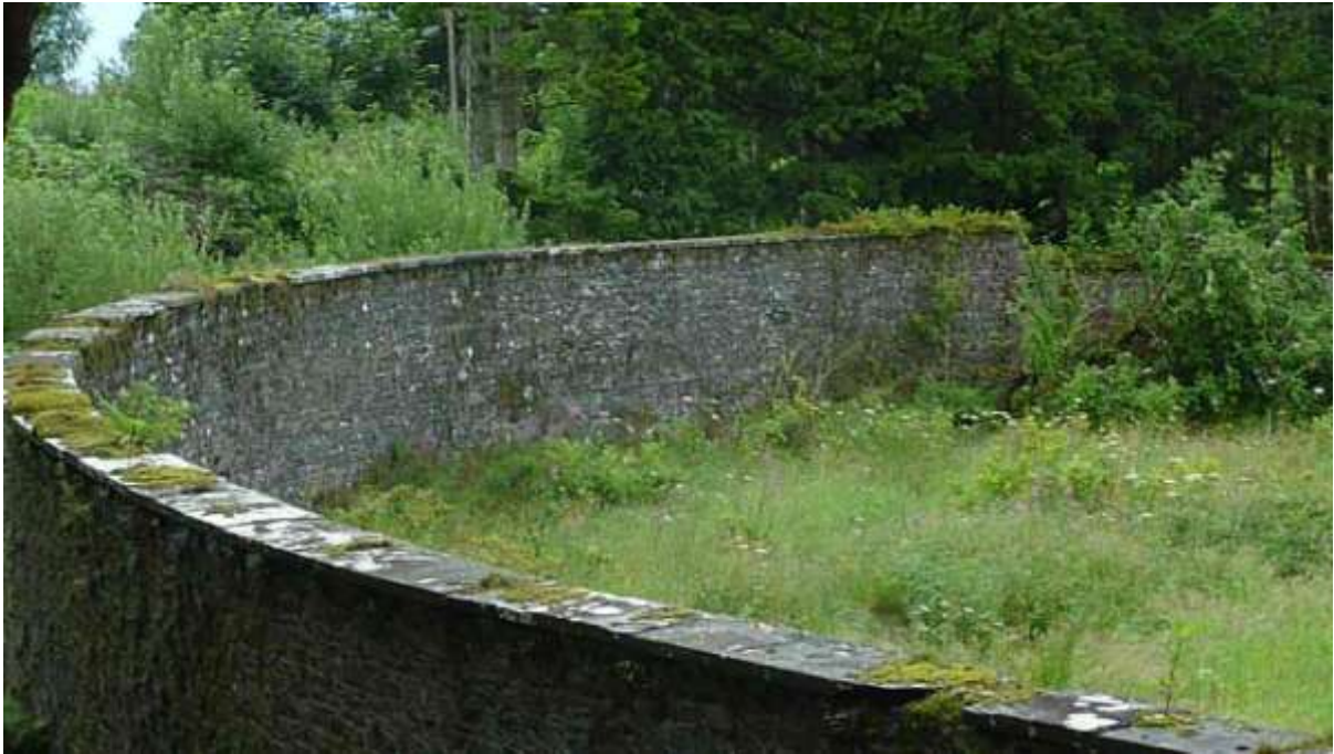
Curved wall at north end

The garden is surrounded by a large stone wall for weather protection and as a heat source for the greenhouses. It should be noted that the wall is of particular significance, being one of only two of its kind in the UK as it has a curved wall and separate curved corner. It is grade 2B listed. The garden has been used at various times over the years by the Forestry Commission, and other individuals for poultry and pig farming. But, in the main, it has been left neglected for long periods of time. The surrounding wall has deteriorated in places and requires restoration.