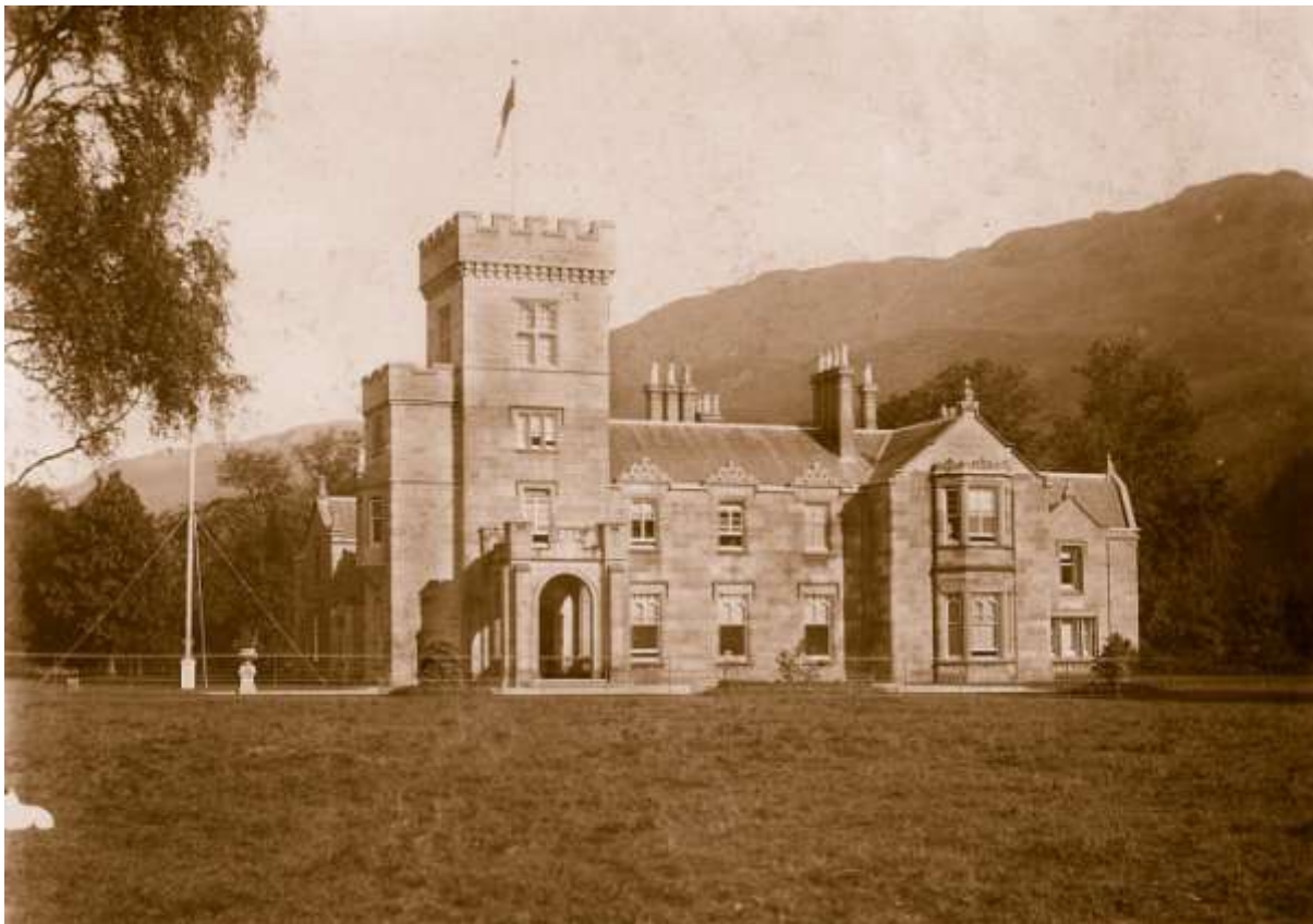
Glenfinart House c.1900